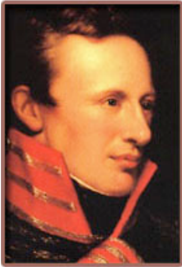
Zebulon Montgomery Pike

Route of the 1806-7 Pike Expedition [in Red]