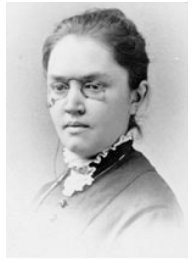
Katharine Lee Bates

America! America! God shed His grace on thee, And crown thy good with brotherhood From sea to shining sea.