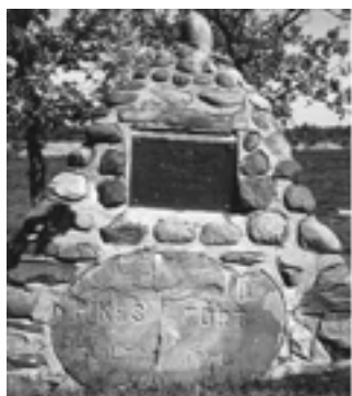
# 4 & 6 Little Falls