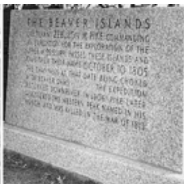
# 2 Beaver I- St. Cloud