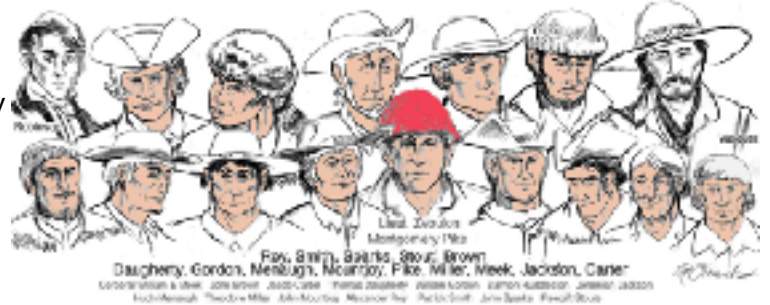
Pike's "Rascals" collage on both expeditions

We are the Brigadier General Zebulon Montgomery Pike International Historic Trail Association, dba the Pike Trail. [BGZMPIHTA] We are based in Conifer Colorado with a winter office in Mesa Arizona.