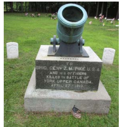
General Zebulon Montgomery Pike's Grave Marker (recently restored)

USS General Pike, was built and launched at Sackets Harbor before the end of that year. After the war his remains were interred to the newly constructed Madison Barracks across the harbor, and in 1909 once again moved as the Army relocated the Sackets Harbor Military Cemetery to its present location. A mortar anchored to a stone block memorial sits on General Pike's final resting spot.