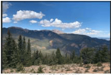
Pikes Peak from Mt. Rosa 7.78 miles distant

Pikes peak from the top of Mt. Rosa From eastern Colorado Springs, you can spot its unique "witch's hat" profile by looking at Pike's Peak.