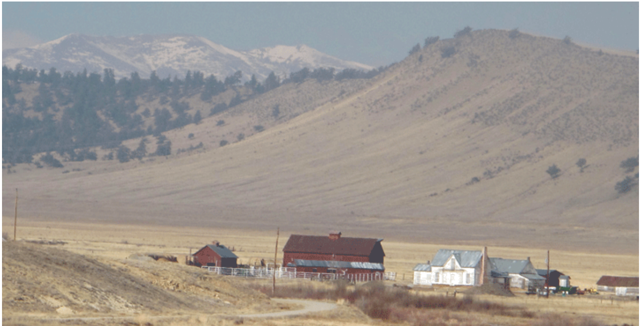
Santa Maria Ranch Hartsel Colorado

Our Purpose: To Establish federal designation of the Pike National Historic Trail A Charitable nonprofit organization zebulonpike.org