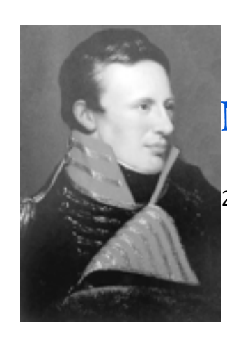
NATIONAL HISTORIC TRAIL