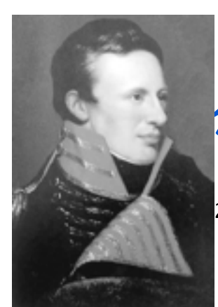
National Historic Trail