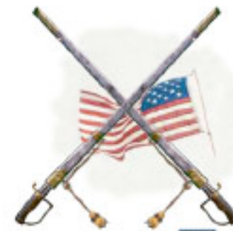
15 star flag, Pike sword & scabbard

Membership- Newsletter Member card or certificate Access to our research & docs Support our Congressional effort & organizational infancy