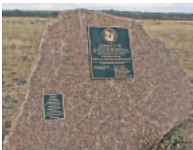
Pike's "Blue Cloud" memorial HH